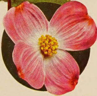
Dogwood—Virginia's State Flower

AMELANCHIER CANADENSIS (Serviceberry, Juneberry). Small, shrub-like tree. White flowers early spring followed by red, juicy berries. 2-3 ft., $2.25 each. 3-4 ft., $3.00 each.